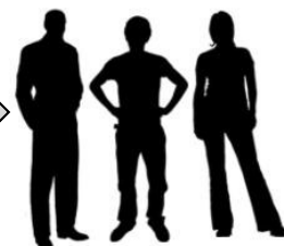
Making good students even better

The IC CAE program provides value-added benefits to students from all majors by increasing their awareness of the diverse agency missions and enhancing their competitiveness for highly-sought-after National Security internships and full time positions with agencies, national labs and contractors. The program funds IC CAE scholars for participation in substantive study abroad experiences. Additionally, IC CAE associates will receive enhanced internship placement services. Students across the University will benefit from an IC Speaker series, and IC brief writing, resume development, and security clearance workshops. A two-pronged approach of enhancing existing courses with IC-relevant teaching modules combined with a long-term vision of a National Security concentration or certificate creates a legacy for future students. This program contributes to broadening students' awareness of National Security issues and global cultures, making them better world citizens regardless of their ultimate career paths.